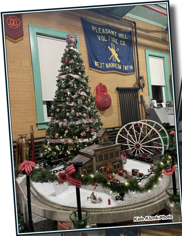
Kate Klunk Photo