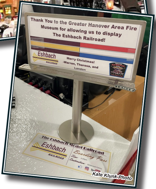
Kate Klunk Photo