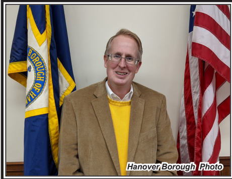
Hanover Borough Photo