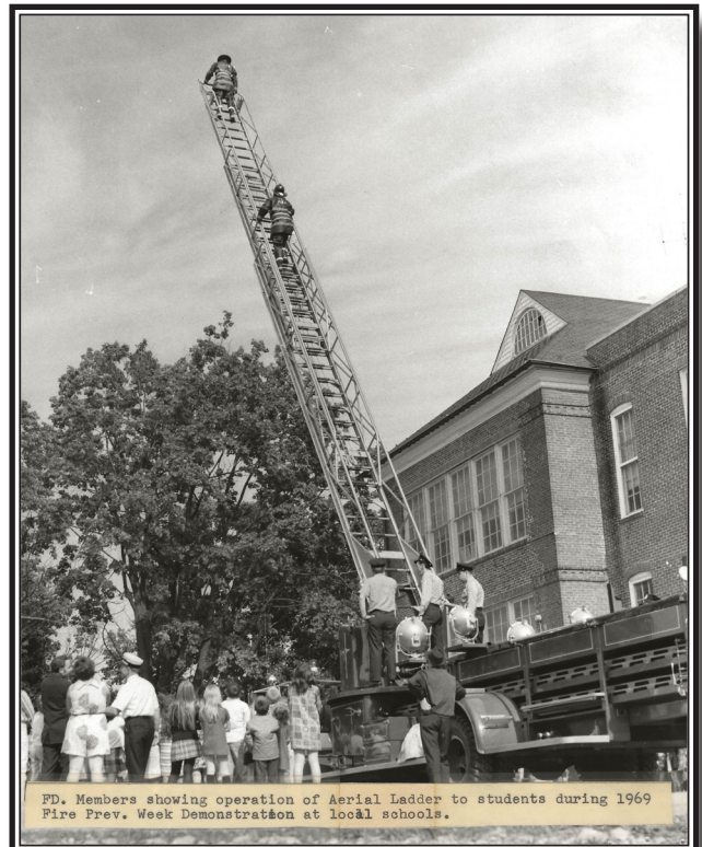
FD. Members showing operation of Aerial Ladder to students during 1969 Fire Prev. Week Demonstration at local schools.