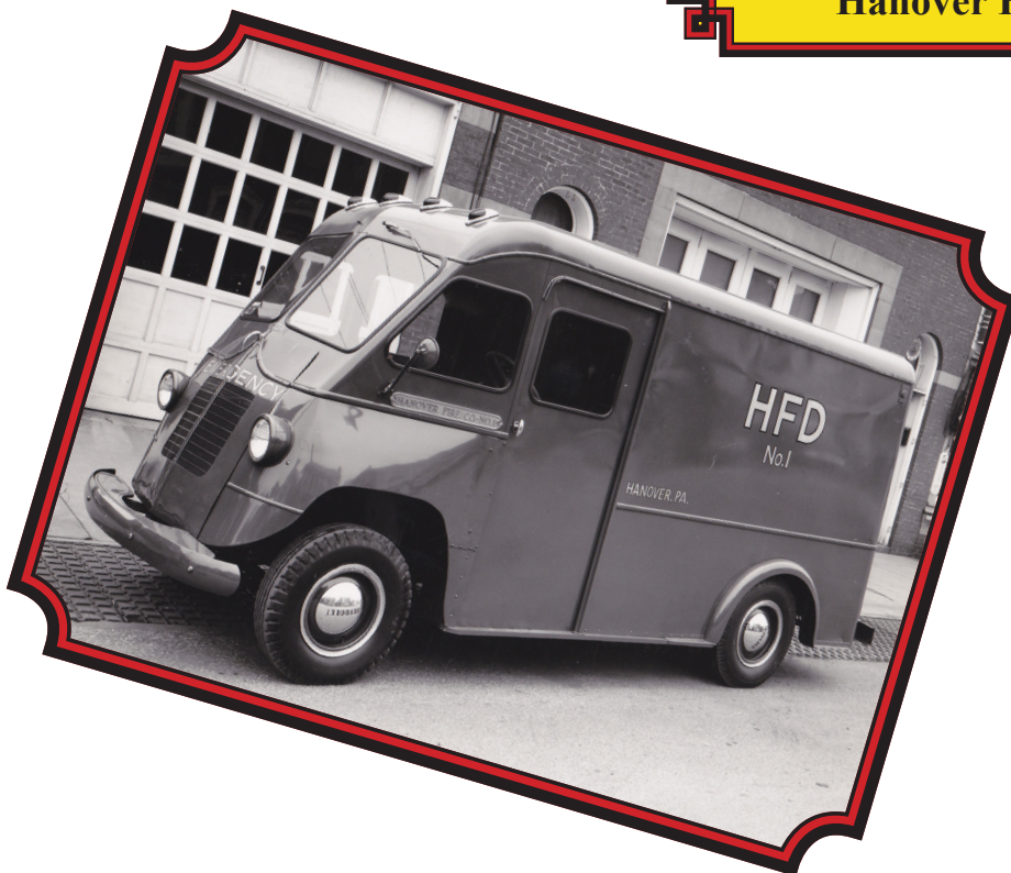
1949 Chevrolet Service Truck Hanover Fire Department No.1

It's always a hoot to step over to the ARCHIVES notebooks in the Fire Museum and have a look at the past. These photos are from the Hanover Fire Dept. No. 1 archives and display a work group of firemen sanding paint and repairing brakes on a 1949 Chevrolet step side truck soon to be transformed into the first service truck for Hanover Fire Co. No. 1. It is thought, of course with debate from museum members if this was purchased from UTZ Potato Chips. You can see the pride of work in the eyes of these men and the end result is very impressive for those times. There was a date of 1951 on the back of the photo of the completed truck, so we assume that is the year it was placed in service.